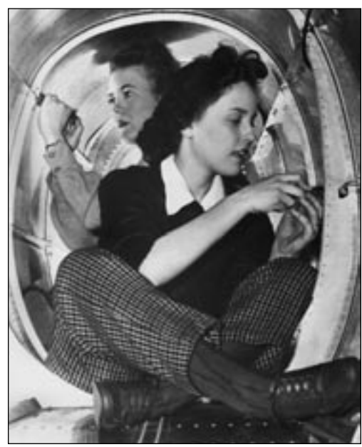
War production aides

Because of Rosie, many women, who had never before worked outside of their homes, entered the high-paying world of war production. Prior to World War II, most women